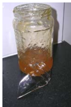
The Compliance & Inspection Unit recently received a consumer complaint about a large piece of glass inside a jar of apricot jam. The glass fragment appeared to be the same type of glass as the jar and most likely came from the production line. Investigations confirmed the product was imported from Poland. The Authority is currently working with the food business to identify the likely source and what needs to be done to make sure it doesn't happen again!