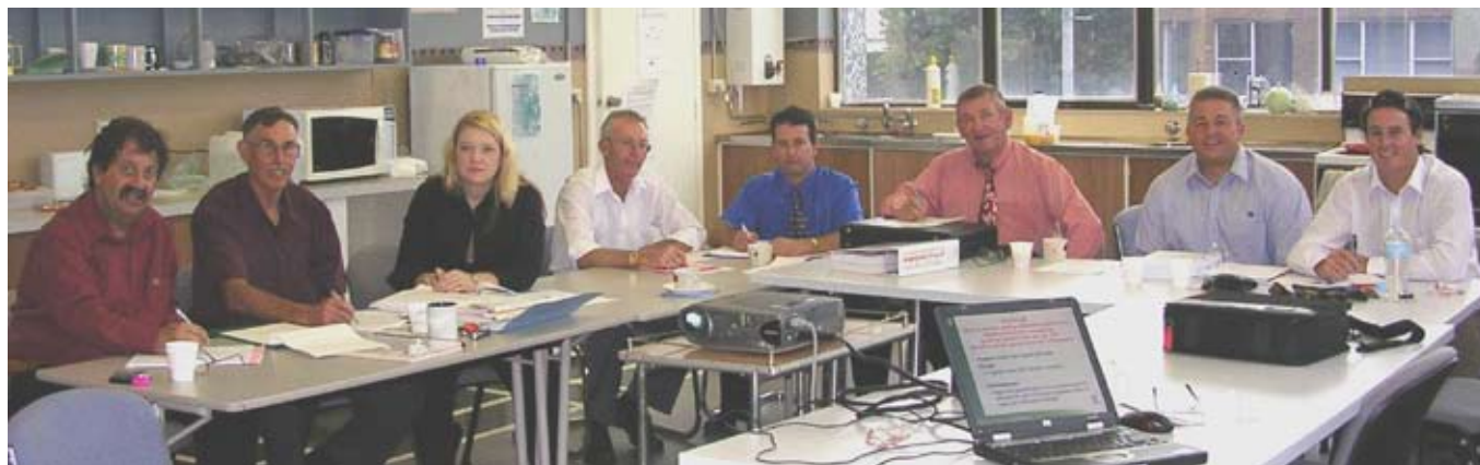
The Illawarra Regional Food Group conduct a recent partnership workshop at Wollongong City Council. Similar workshops were held all around NSW.