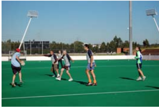
SFA brick wall about to stomp an opponent into the astro-turf.