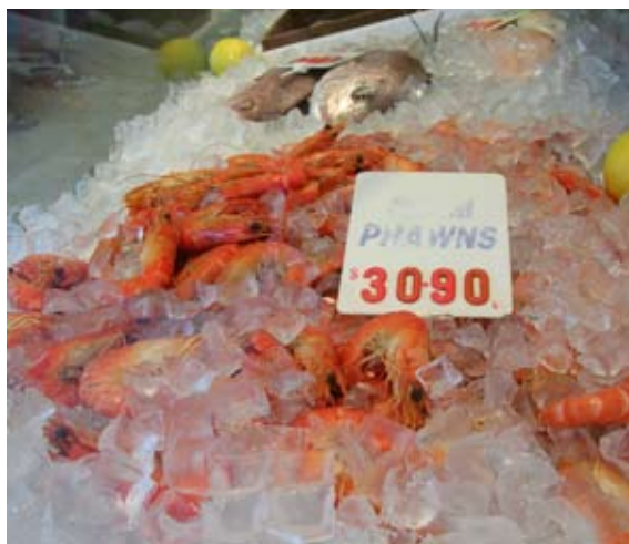
Large operation uncovers widespread breaches of Food Act

The State Government has adopted a "zero tolerance" approach to incorrectly labelled seafood after a major three-month joint operation. Officers from the NSW Food Authority and Department of Primary Industries (DPI) checked 293 restaurants, seafood retailers, wholesalers, processors and commercial fishers between Tweed Heads and Eden between February and May for breaches of the Food Act and black-market fishing. Primary Industries Minister Ian Macdonald said there were 255 offences under the Food Act.