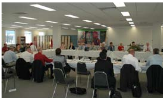
ISC meeting at Food Authority head office.

The Authority hosted the 11th meeting of the Implementation Sub Committee (ISC) at its head office in Newington during June. ISC includes representatives of all food regulators from Australia and New Zealand. ISC develops guidelines on food regulations and standards implementation and enforcement activities. This is aimed at achieving a consistent approach to the way regulations and standards are interpreted and enforced across jurisdictions, regardless of whether food is sourced from domestic producers, export-registered establishments or from imports. In conjunction with ISC 11, the Authority co-hosted (with the New Zealand Food Safety Authority) a workshop on local government roles in food regulation. ISC recognises the important role local councils play in food regulation and that collaboration between jurisdictions and councils