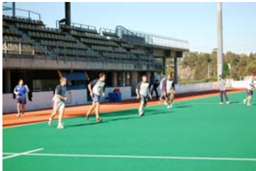
SFA all stars show a quick turn of speed.