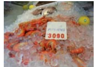
The Food Authority enforced the Government's "Zero Tolerance" approach to consumer rip offs and unsafe food.

businesses that represent a risk to public health. In addition, the Authority participated with the Department of Primary Industries in a joint operation that checked