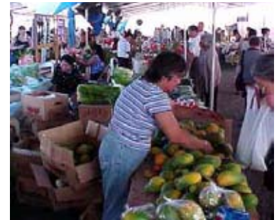
New guidelines help improve the safety of temporary food events, while also cutting red tape.

The Authority released a set of new guidelines to improve the safety of temporary food events and reduce red tape. "Food Handling Guidelines for Temporary Events" will reduce duplication by having one set of uniform regulations covering markets and special food events across NSW. The guidelines address food safety issues, including hygiene, disposal of waste, food handling, and include a checklist so vendors are aware of everything they need to do to comply with safe food laws.