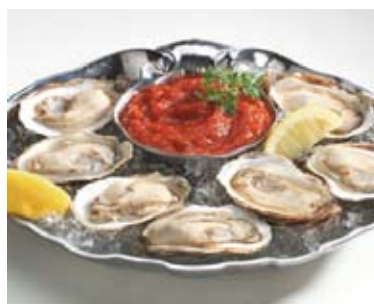
NSW Shellfish Program passes AQIS "Export Quality" inspection for the third time.

The NSW Shellfish Program, which is administered by the Food Authority, passed the Australian Quarantine Inspection Services' rigorous "Export Quality" inspection. The Shellfish audit, which passed with distinction, means farmers in approved areas can export their oysters direct to overseas markets. This is the third time the Program has passed the demanding AQIS export audit. The Program manages oyster production across the state by closely working with industry to monitor water quality and the safety of oysters.