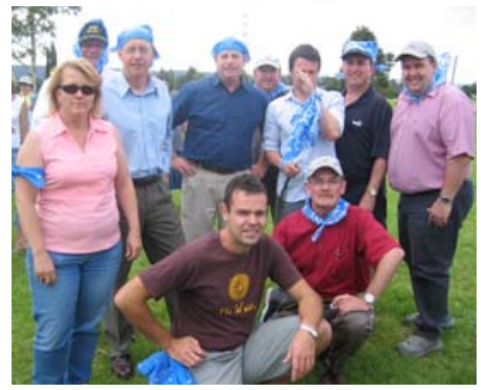
Blue team look like they mean business...