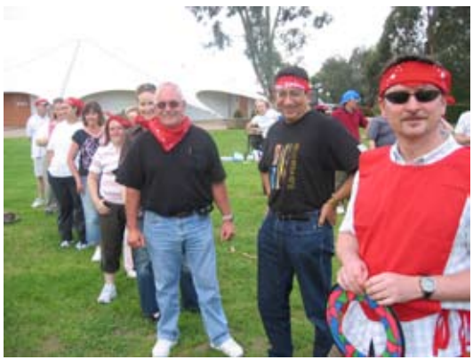
Red team look menacing...