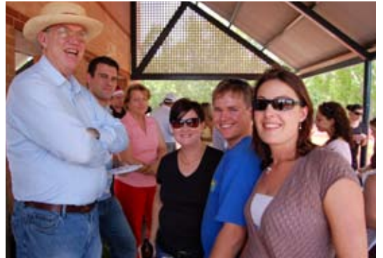
Head office staff at their Bicentennial Park Chrissy lunch.