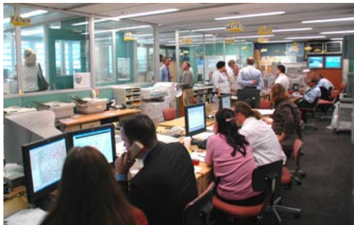
The State Emergency Operations Centre command room. Food Authority staff joined dozens of staff from other Federal and State agencies in the mock bird flu exercise.