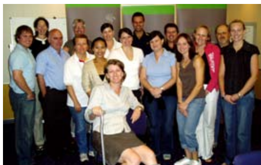
Assorted staff at the 2005 Staff Conference