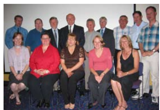
Award winners with George and the Minister