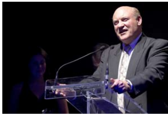
NSW Primary Industries Minister Ian Macdonald discusses the seafood industry's future potential and opportunities.