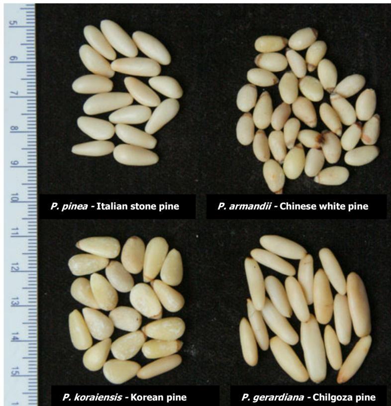
Figure 1. Pine nut varieties (from Zonneveld, 2011)